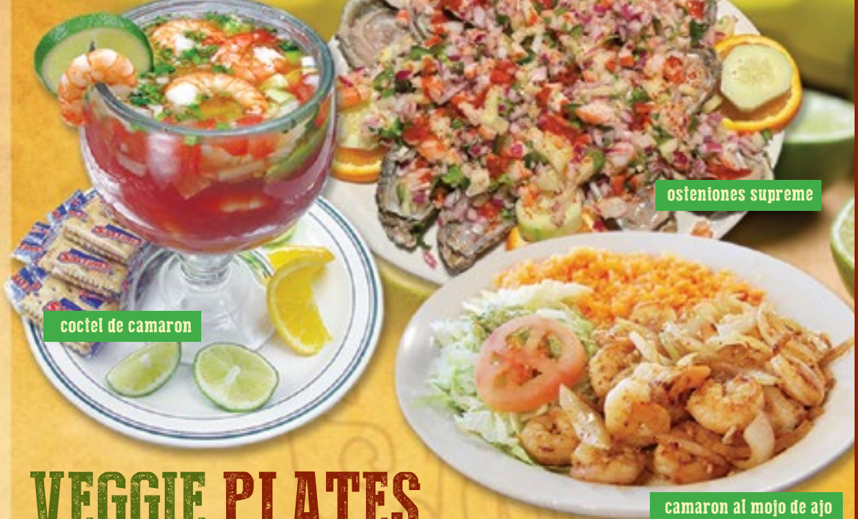
coctel de camaron

A bountiful plateful of grilled shrimp topped with cheese and served with rice - 17.99