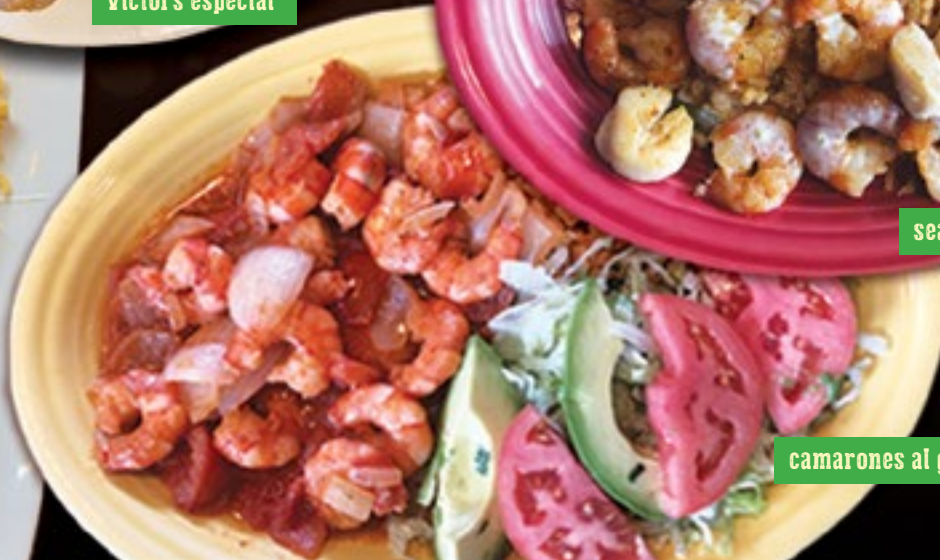
camarones al gusto