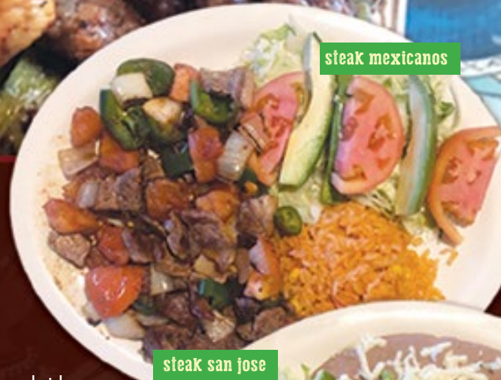
steak san jose