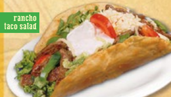
rancho taco salad